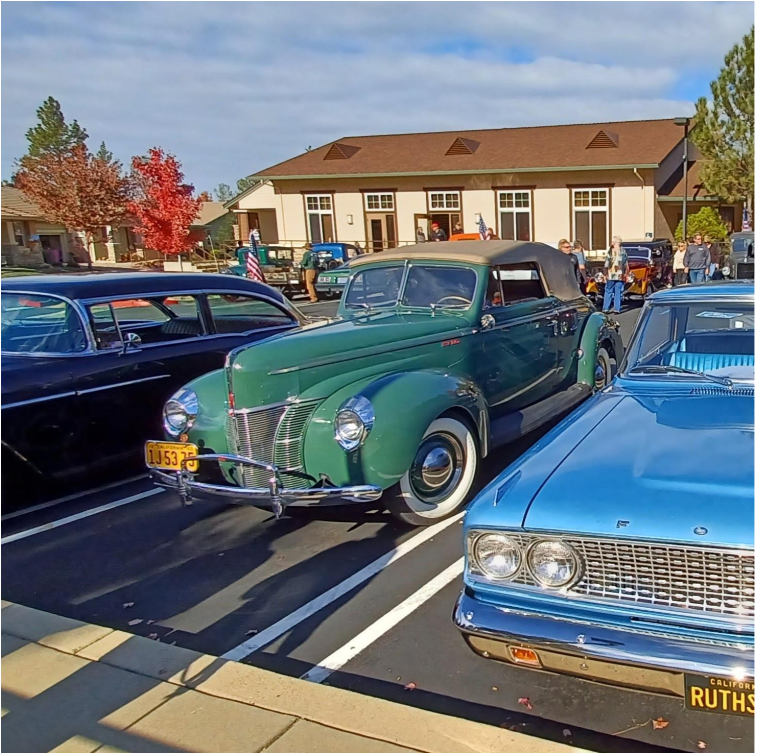
Dan Schwartz car