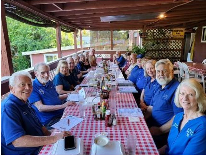
Wow What a Motley crew.